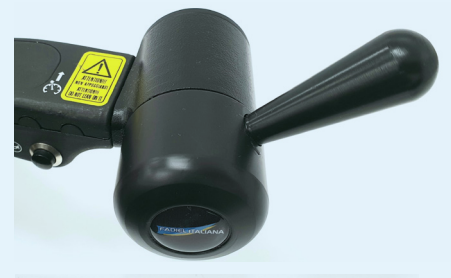
Carbon Look Finish