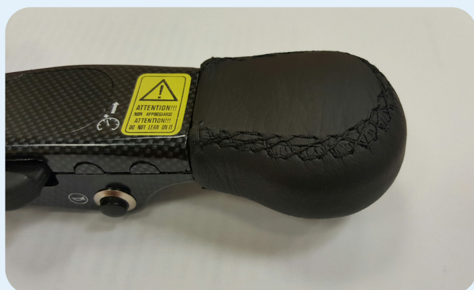
Leather End Knob