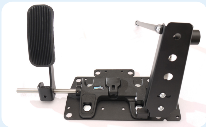
Left Foot Accelerator unit attached to the base plate