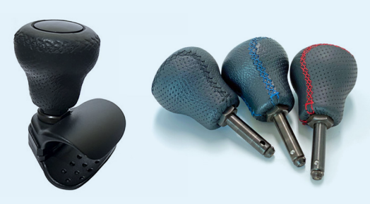
(Standard rubber and leather options)